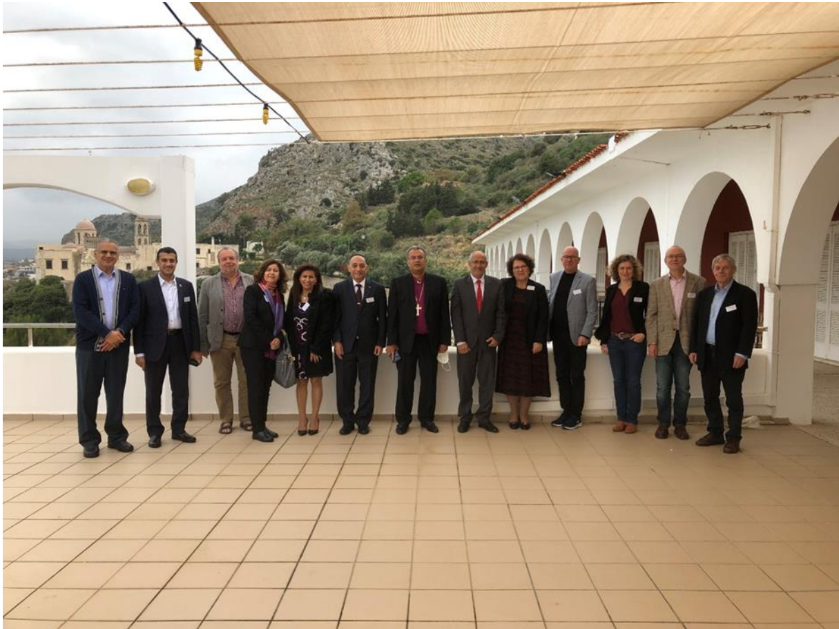
The participants at the meeting of the AECD at the Orthodox Academy of Crete, in October 2021

Consultations of the AECD will be in Cairo (6-10 November 2022) and in Sigtuna (June 2023).